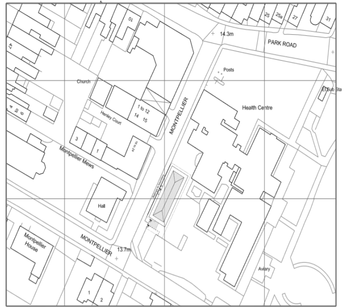
Block Plan @ 1:500 0m 10m 20m 30m 40m 50m 60m 70m 80m 90m 100m