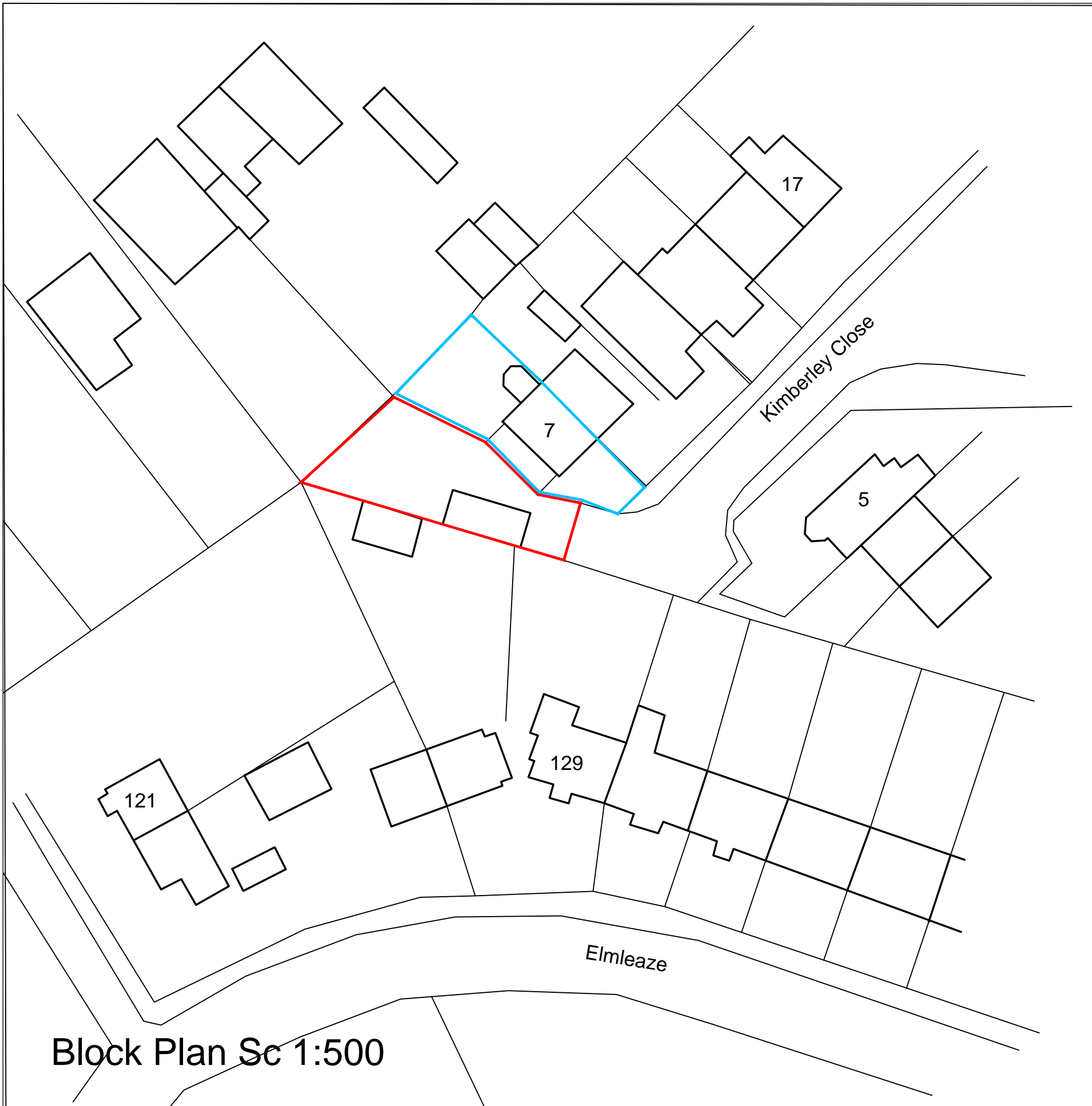
Block Plan Sc 1:500