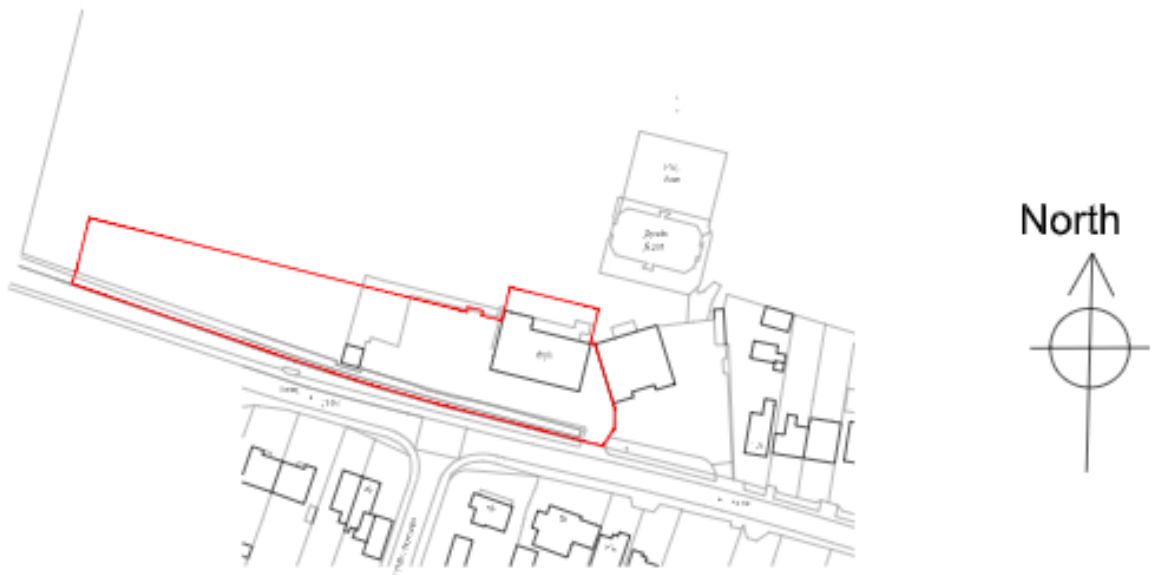
Location Plan @ 1:1250