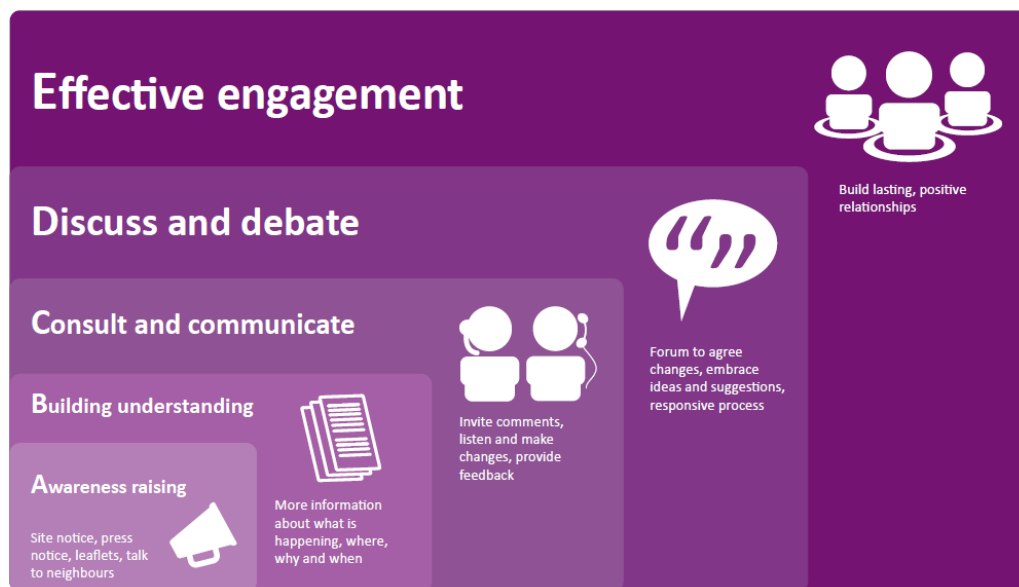
Figure 1: Types of Engagement